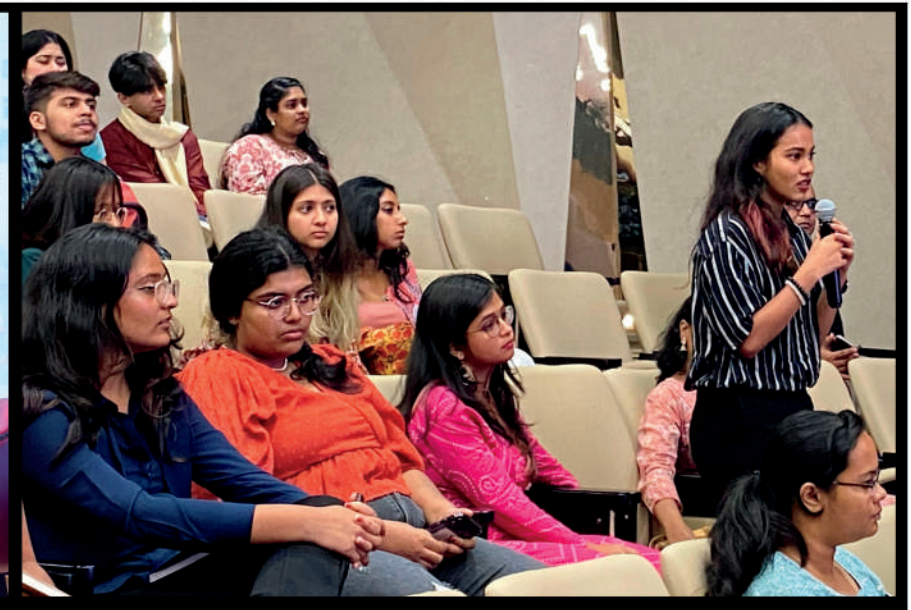
Q&A session at the end of the panel