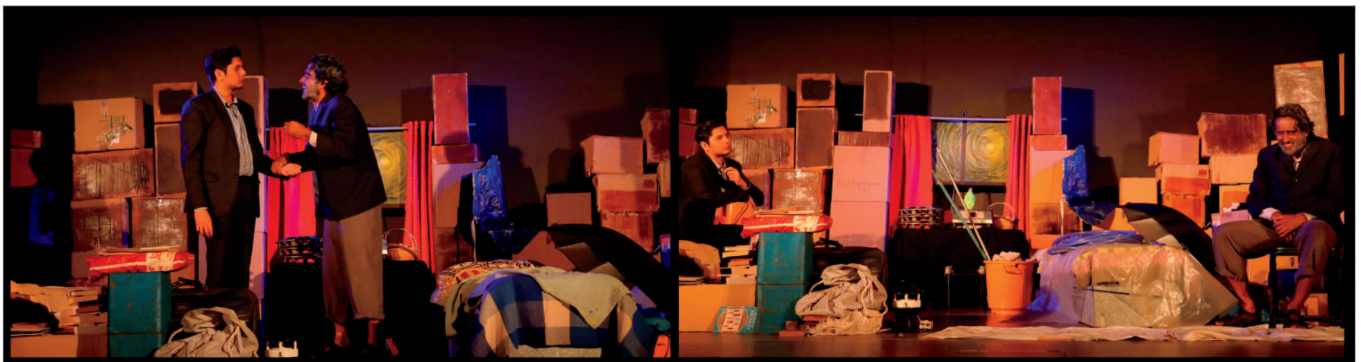
Stills from The Caretaker