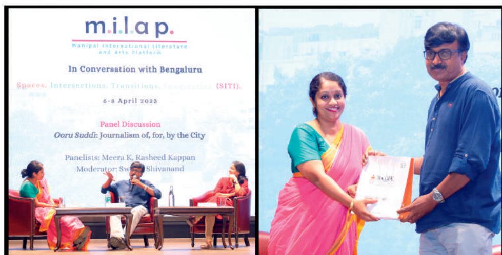
Dignitaries on the stage