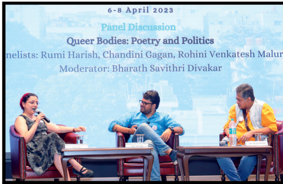
Panelists on the dais