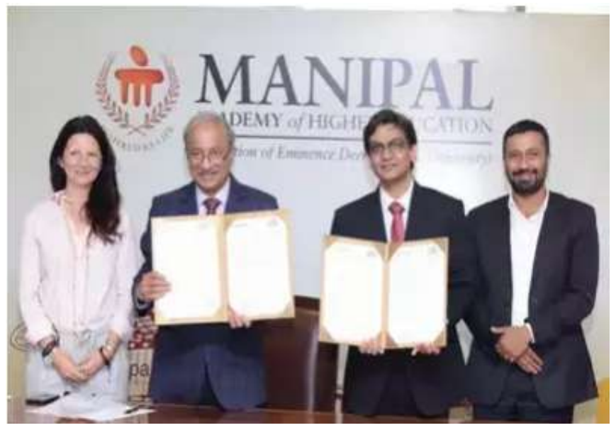
Celebration of Polish Science Day at MAHE

On 19 February 2021, the Office of International Affairs and Collaborations (OIAC) and the Department of Languages had organised the Polish Science Day celebration, and announced the inauguration of the National Agency of Academic Exchange