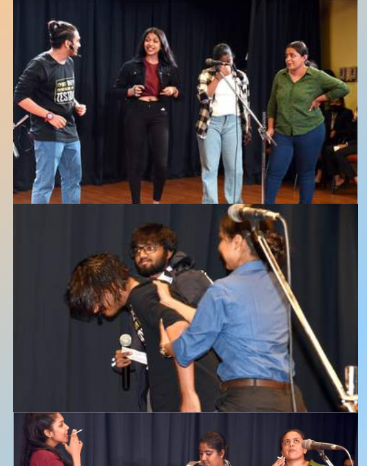
(Above) DOC Students enacting a skit to showcase the repercussions of substance abuse