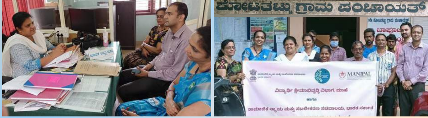
(Above) NMUA team at Kotathattu Grama Panchayath on Nov. 18, 2021