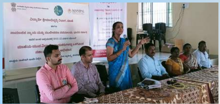
(Left & Above) NMUA team at Kota Grama Panchayath on Nov.18, 2021