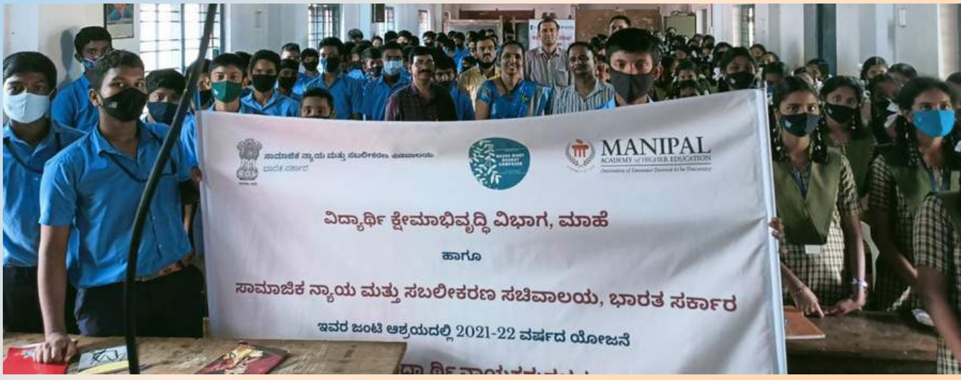
Students of Government Composite High School, Manur participating in the awareness program