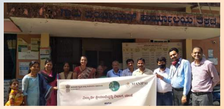
(Above) NMUA team with members of Thekkatte Gram Panchayath on Dec. 7, 2021