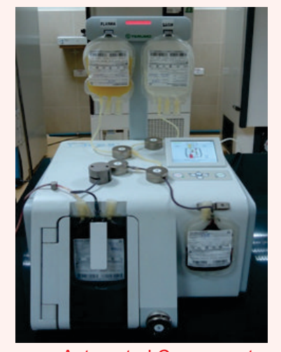
Automated Component Separation