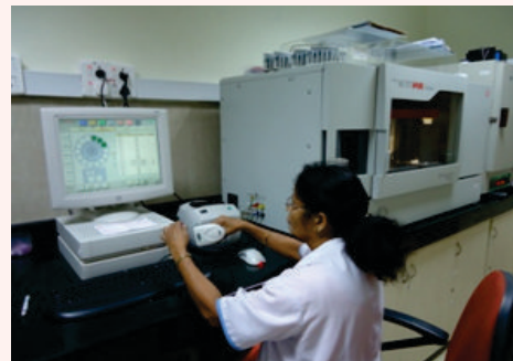
Automated Blood Grouping