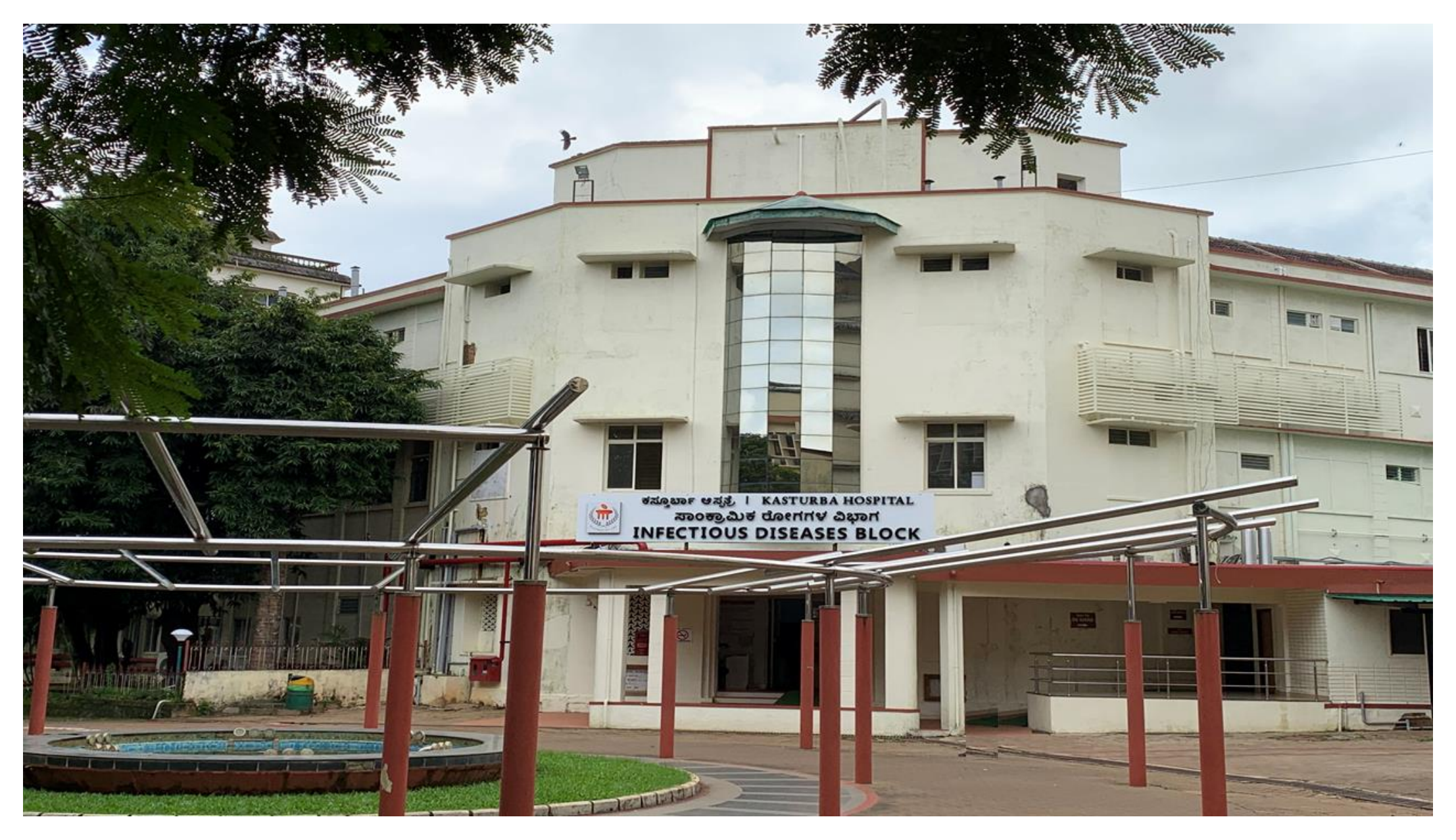
Infectious Diseases Inpatient Block at Kasturba Medical College