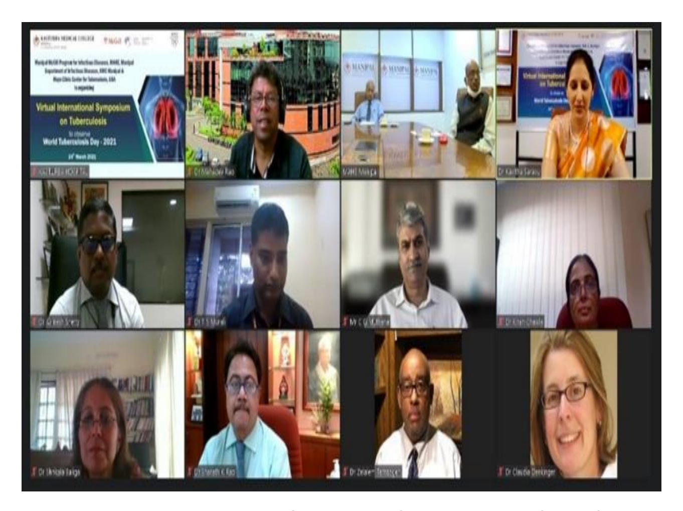
Department of Infectious Diseases, KMC Manipal & Mayo Clinic Centre Tuberculosis, USA organised a Virtual International Symposium on Tuberculosis on March 24, 2021