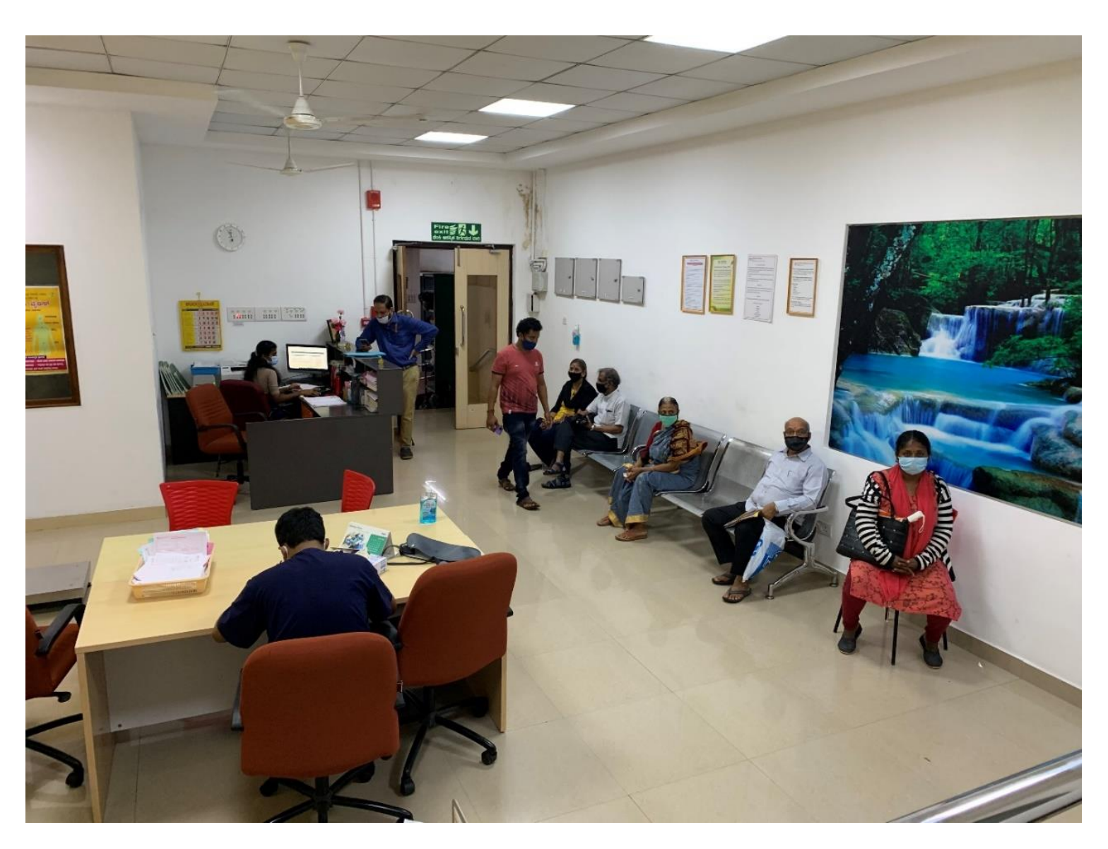
Outpatient Department at Department of Infectious Diseases