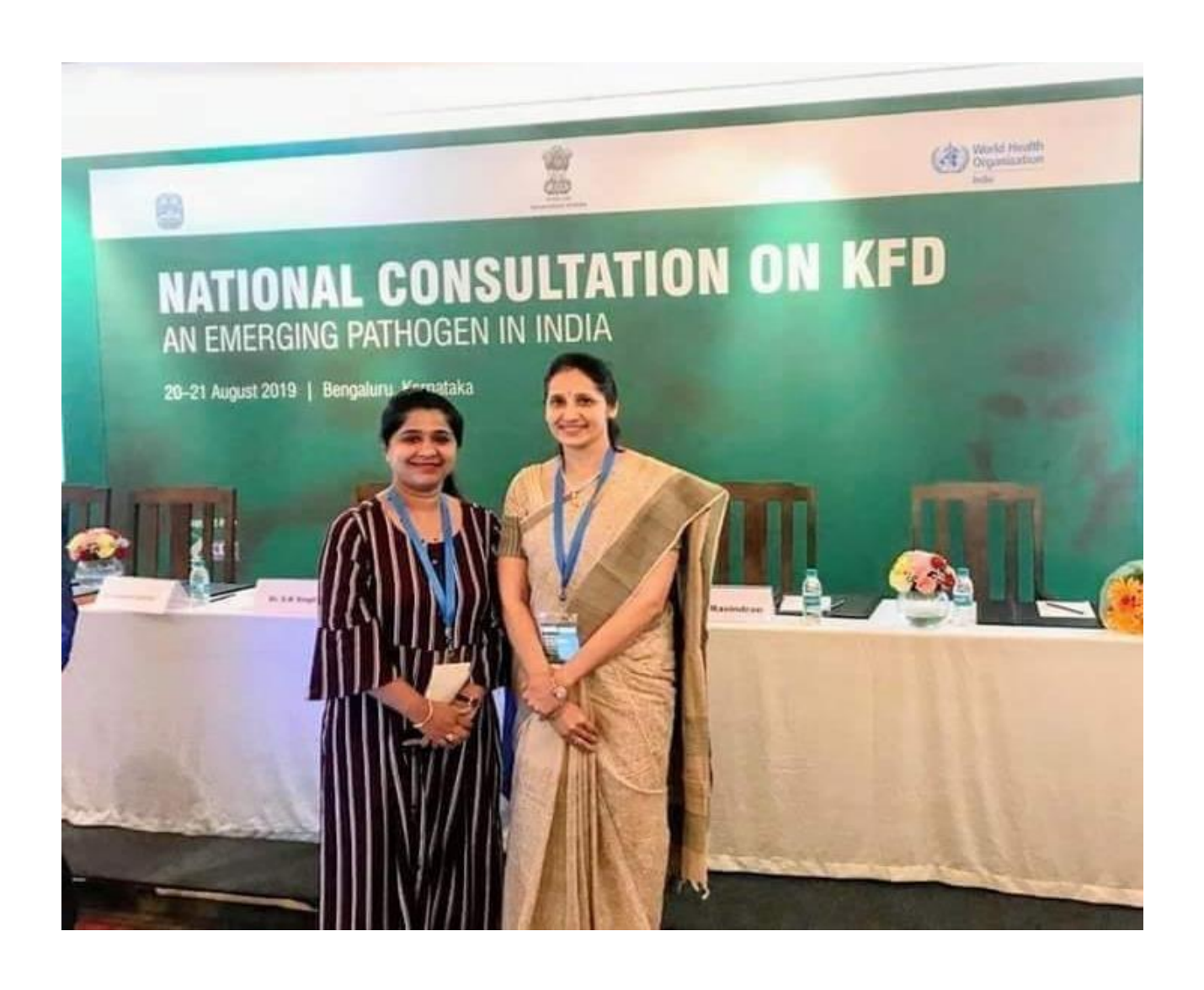
Faculty were invited for national consultation on KFD to give their clinical expertise