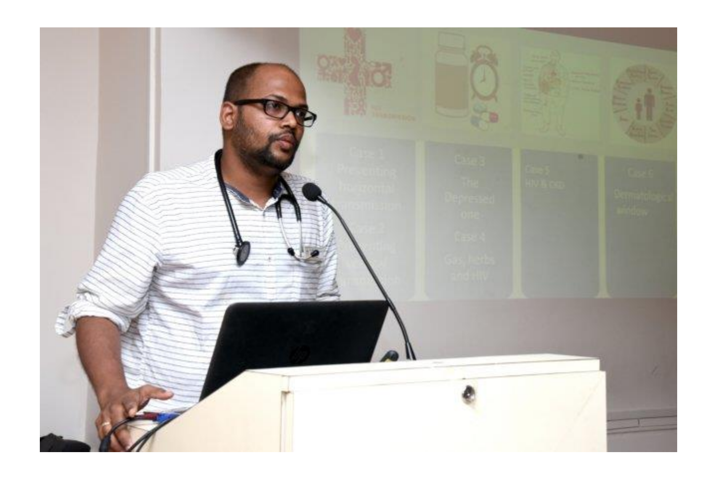
A half day Symposium on HIV was held on 04th November 2019 organized by Manipal Center for Infectious Diseases (MAC ID) in association with Departments of Medicine & Infectious Diseases, Kasturba Medical College, Manipal