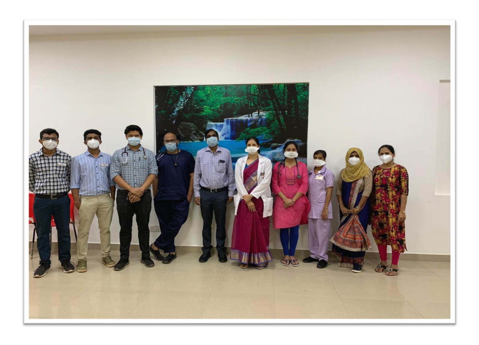
Faculty, Administrative and Research Staff of Department of Infectious Diseases