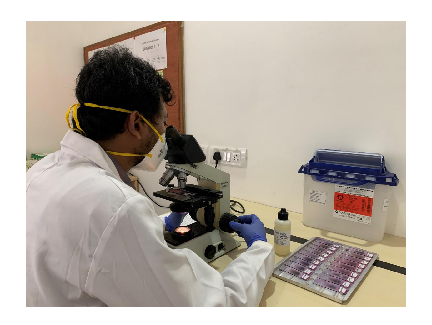
Research Laboratory at Department of Infectious Diseases