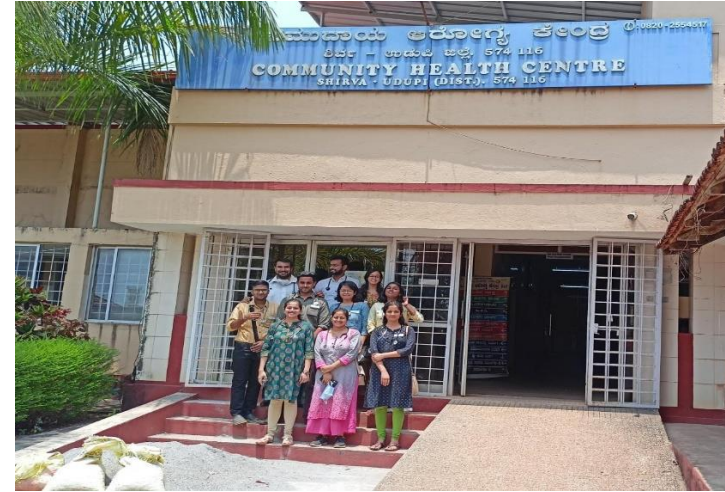
CHC - Shirva