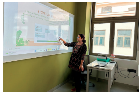
Workshop on biophilic design