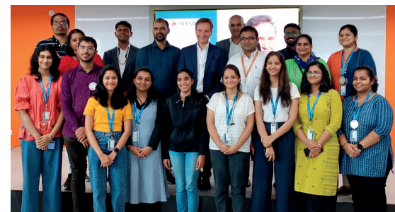
Session with Hertie School, Germany