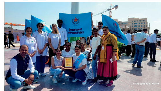
Independence Day 2023