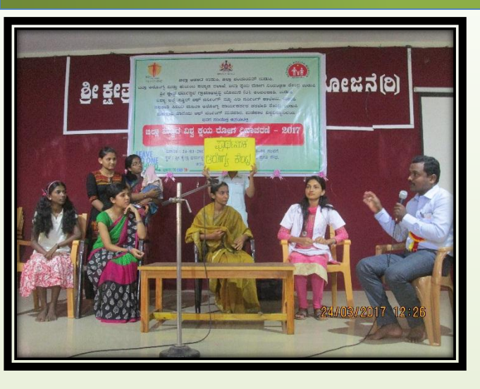
"World Tuberculosis Day- 2017"

As a part of World Tuberculosis Day 2017, the faculty of the Department of Medical Surgical Nursing and the Department of Community Health Nursing of Manipal College of Nursing Manipal organised Poster competition on the theme 'Unite to end TB' on 24<sup>th</sup> of March 2017 in Pulmonary care ward of Kasturba Hospital, Manipal and Socio Drama at Praghati Soudha, Sri Kshetra Dharmasthala Rural Development and Training Centre Udupi.