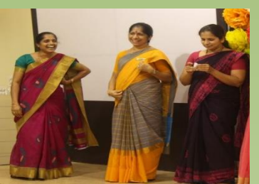
September 5, 2018 from 2:00-3:30pm