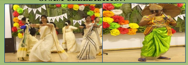
September 5, 2018 from 3:30pm to 5.00pm.