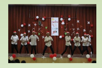
December 17, 2018