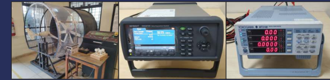
Wind turbine training system