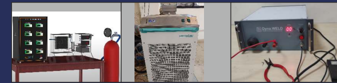
Fuel cell training system