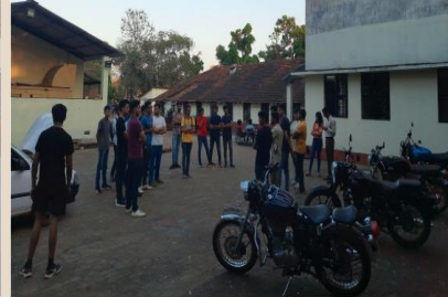
Automotive Engines Workshop, Automotive Transmission Workshop, Vehicle Display + Aerodynamics Workshop

This workshop involved the junior members of the club learning about various components of internal combustion engines used in automobiles and all driveline components of a combustion-driven vehicle downstream of the flywheel.