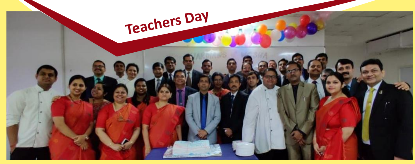
Students of WGSHA, Celebrated 'Teachers Day 2019' by conducting different activities for the faculty with a Cake Cutting.