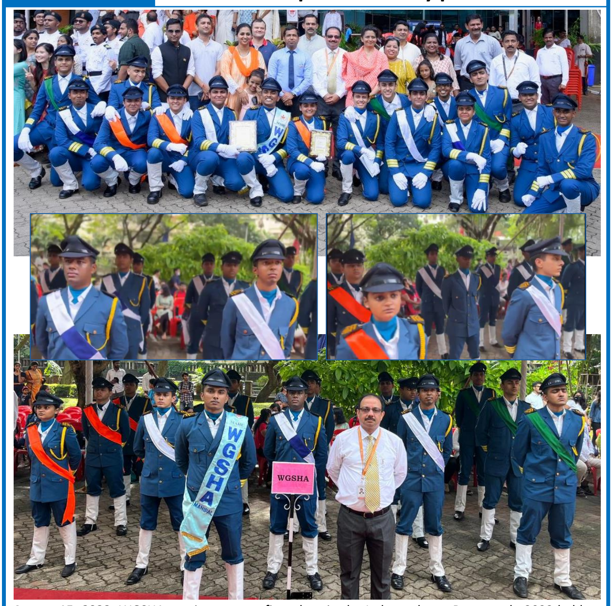
August 15, 2022: WGSHA contingent won first place in the Independence Day parade 2022 held at Manipal Academy of Higher Education (MAHE) Manipal. 23 contingents participated in the parade which was held on the 76th Independence Day of the country.

Students of Welcomgroup Graduate School of Hotel Administration (WGSHA) marched in rhythm to the marching band with chest high and a gleam in their eyes.