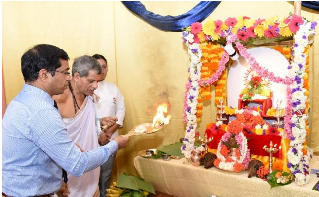
August 30, 2022: Students enjoyed the hostel festival Ganesh Chaturthi at WGSHA hostel premises. Learning about organizing an event, also understanding the purpose, culture, and theme behind each event was the main objective of every hostel festival.

Student participation from various departments such as Food & Beverage service, Production, and Housekeeping made the hostel festival celebration Ganesh Chaturthi a grand success.